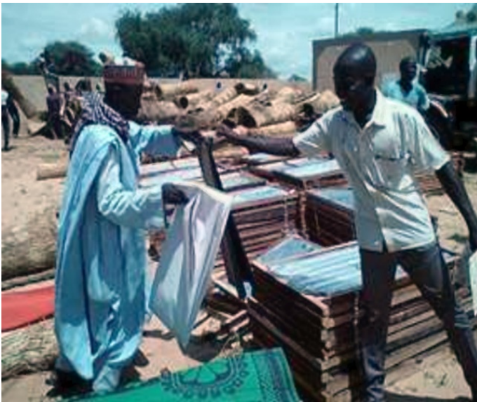
Shelter fairs in Diffa, Niger