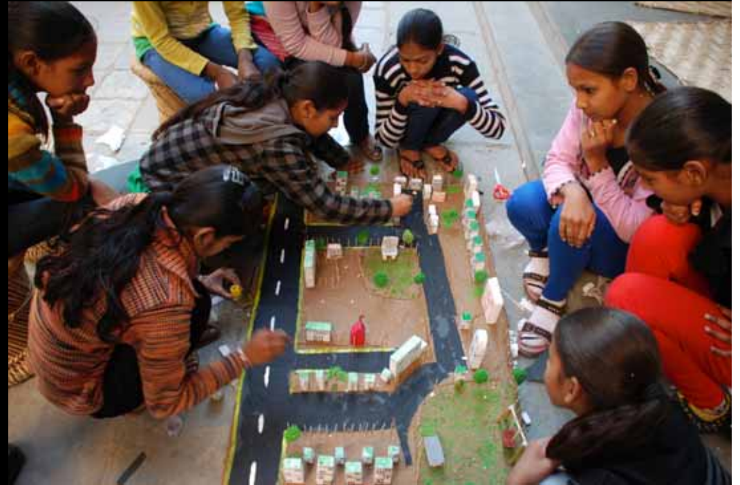
Community planning workshop