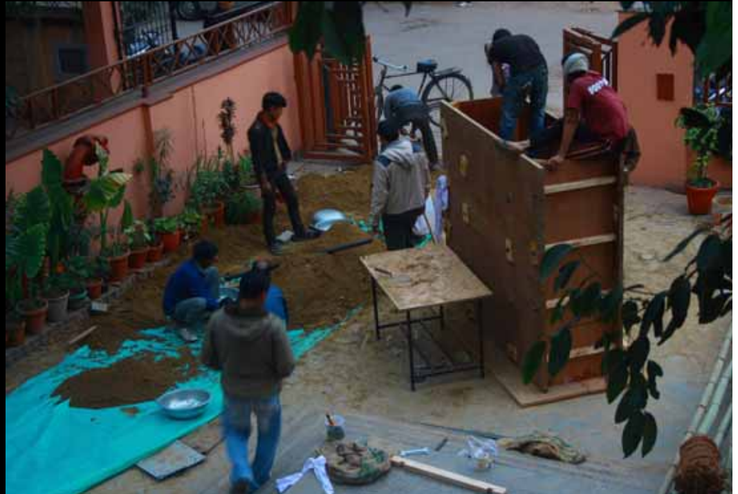
Live and interactive Installations