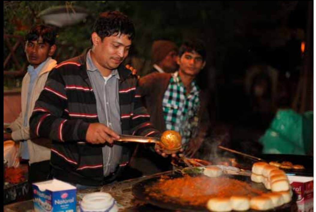
Live Music and stonking street food