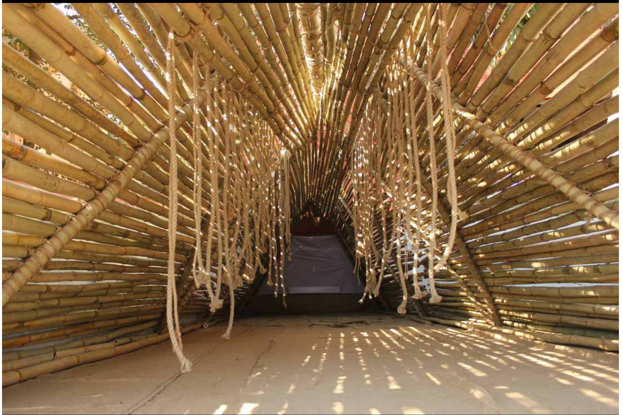
Live and interactive Installations