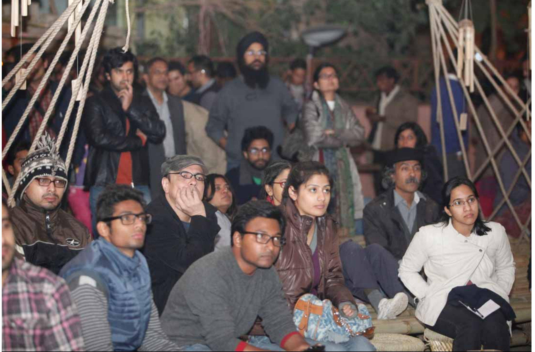
People Tree Talks