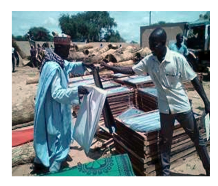
Shelter fairs in Diffa, Niger