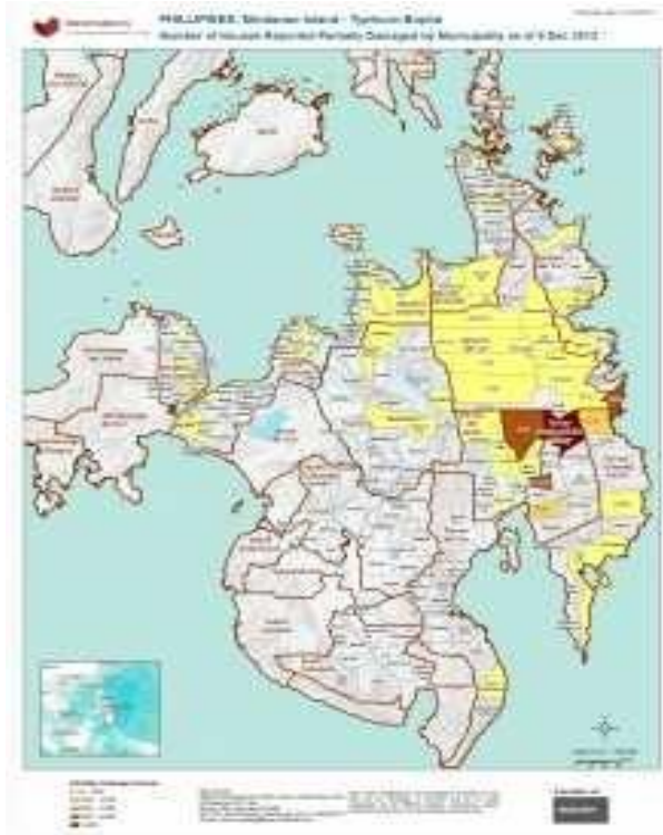
REACH map showing partially damaged or destroyed houses on 9 th December 2012