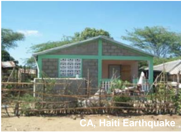
CA, Haiti Earthquake