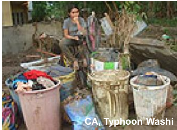
CA, Typhoon Washi