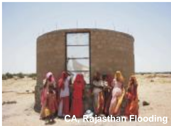
CA, Rajasthan Flooding