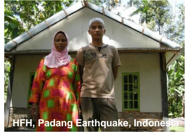
HFH, Padang Earthquake, Indonesia