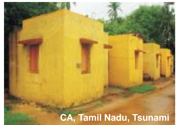
CA, Tamil Nadu, Tsunami