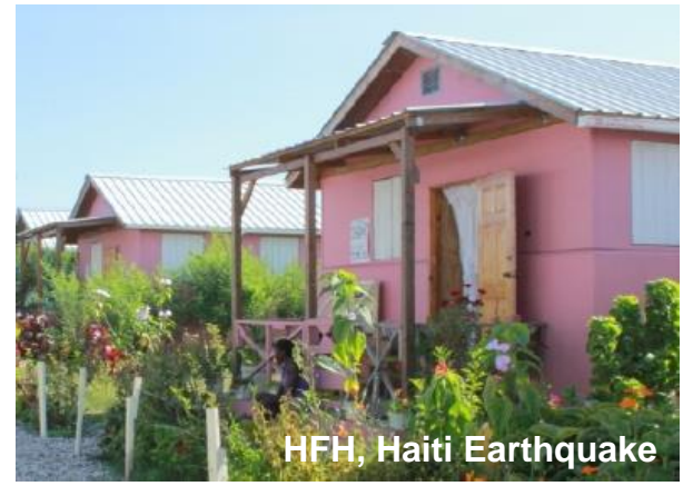
HFH, Haiti Earthquake