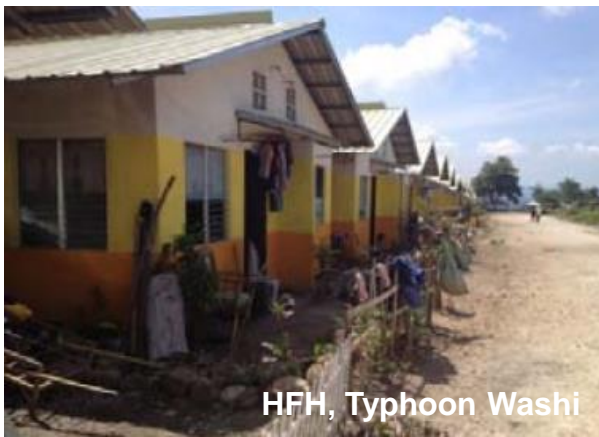
HFH, Typhoon Washi